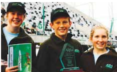
Future farmers show off skills. PG.32