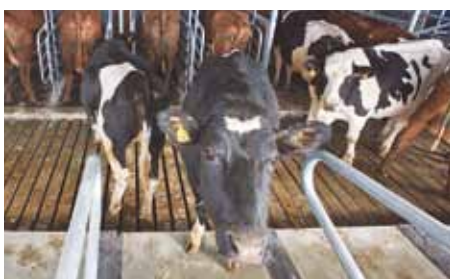
Study finds in-shed technology popular. PG.36