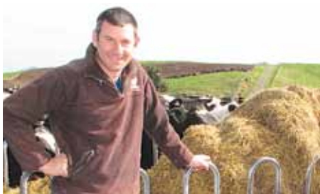
Huge grazing farm trims feed waste. PG.46